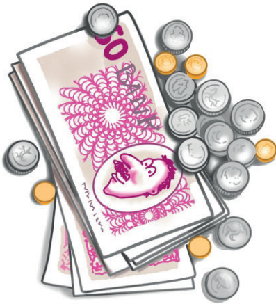
Copyright ©2020 Speech Link Multimedia Ltd