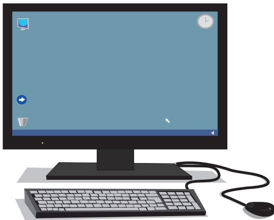
Copyright ©2020 Speech Link Multimedia Ltd