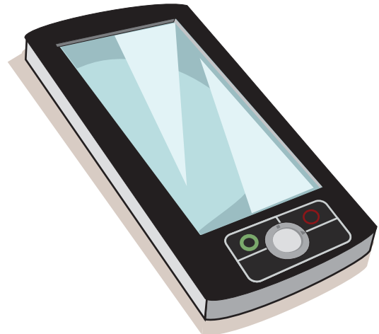
Copyright ©2020 Speech Link Multimedia Ltd